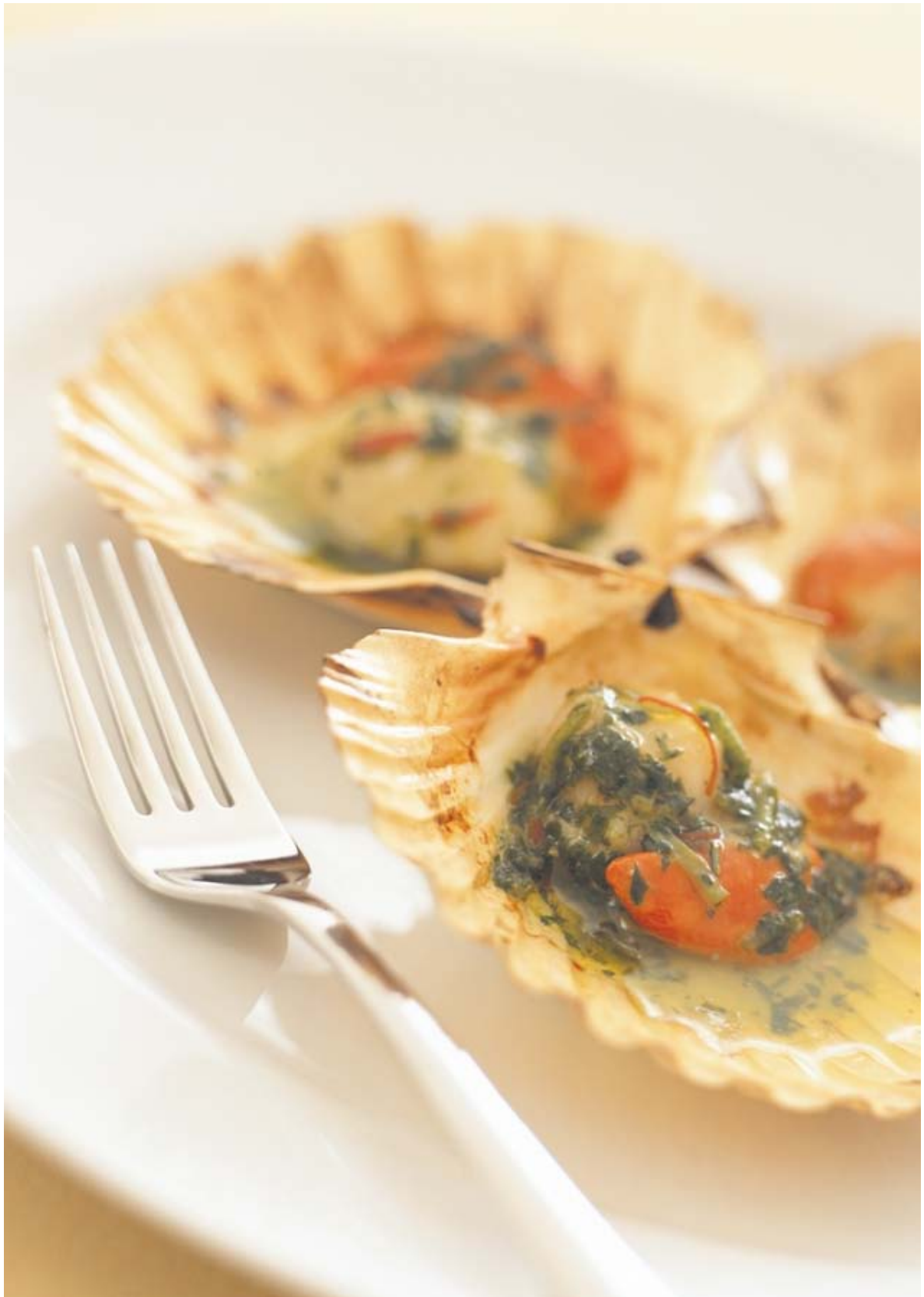
Grilled Tasmanian Scallops, Marinated in Olive Oil, Chilli, Lime and Coriander, Served in the Shell