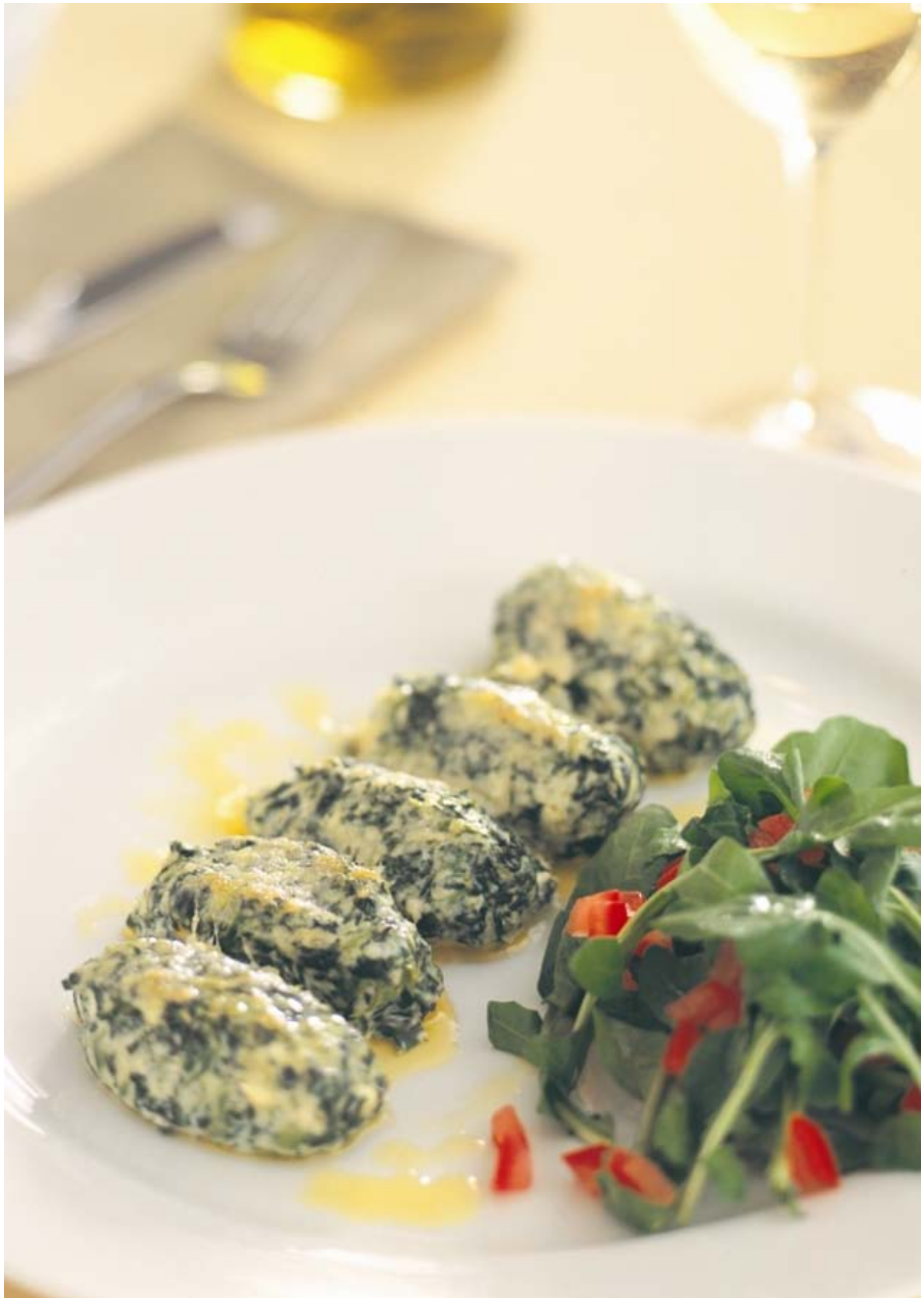
Spinach and Ricotta Gnocchi