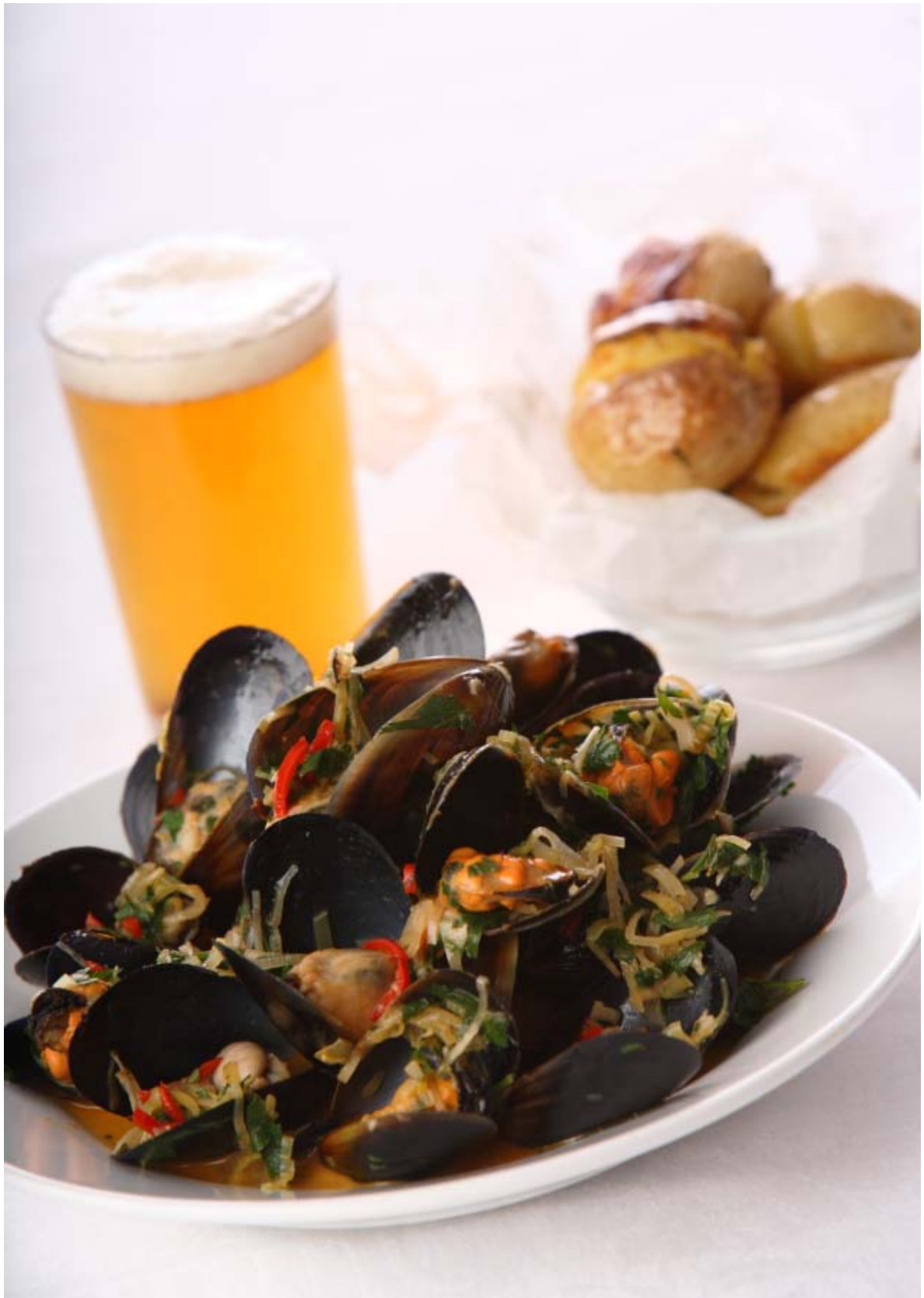
Black Mussels in White Wine, Leek and Garlic Sauce and Baked Chats