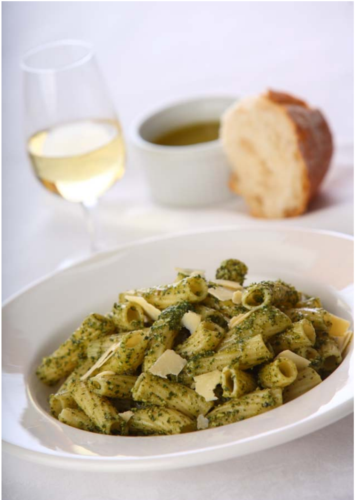
Penne Pasta with a Basil Pesto Sauce