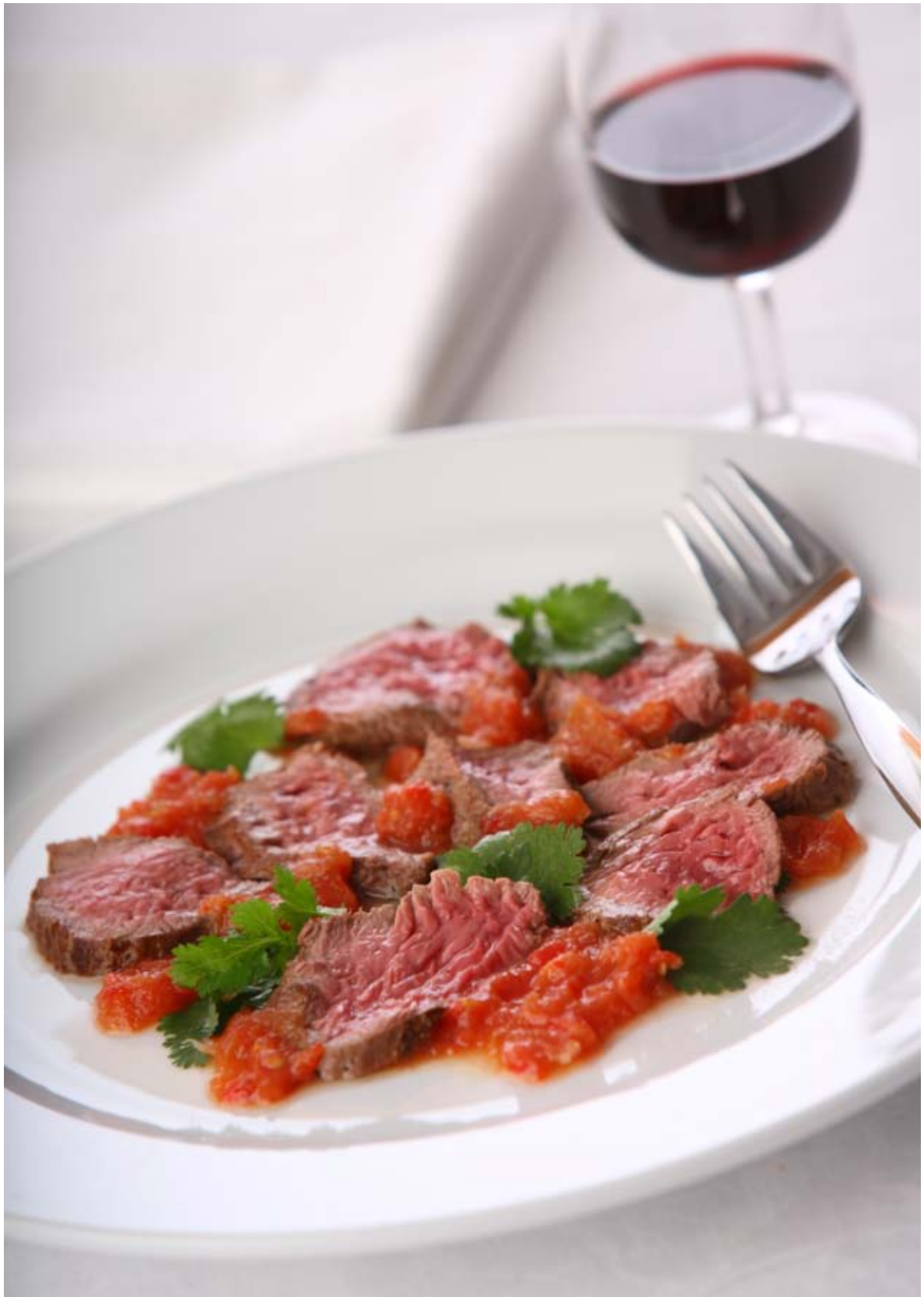
Kangaroo Salad, Grilled and Served with a Tomato and Chilli Relish and Fresh Coriander