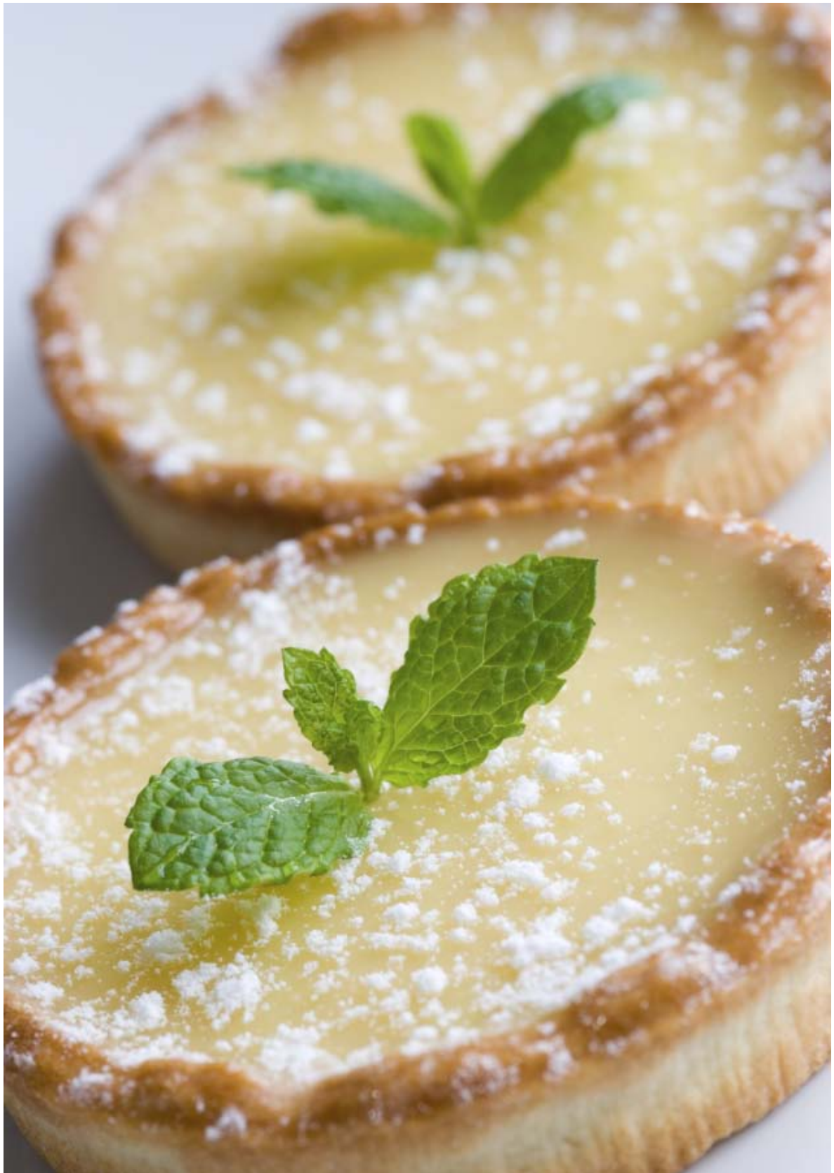
Lemon and Lime Tart