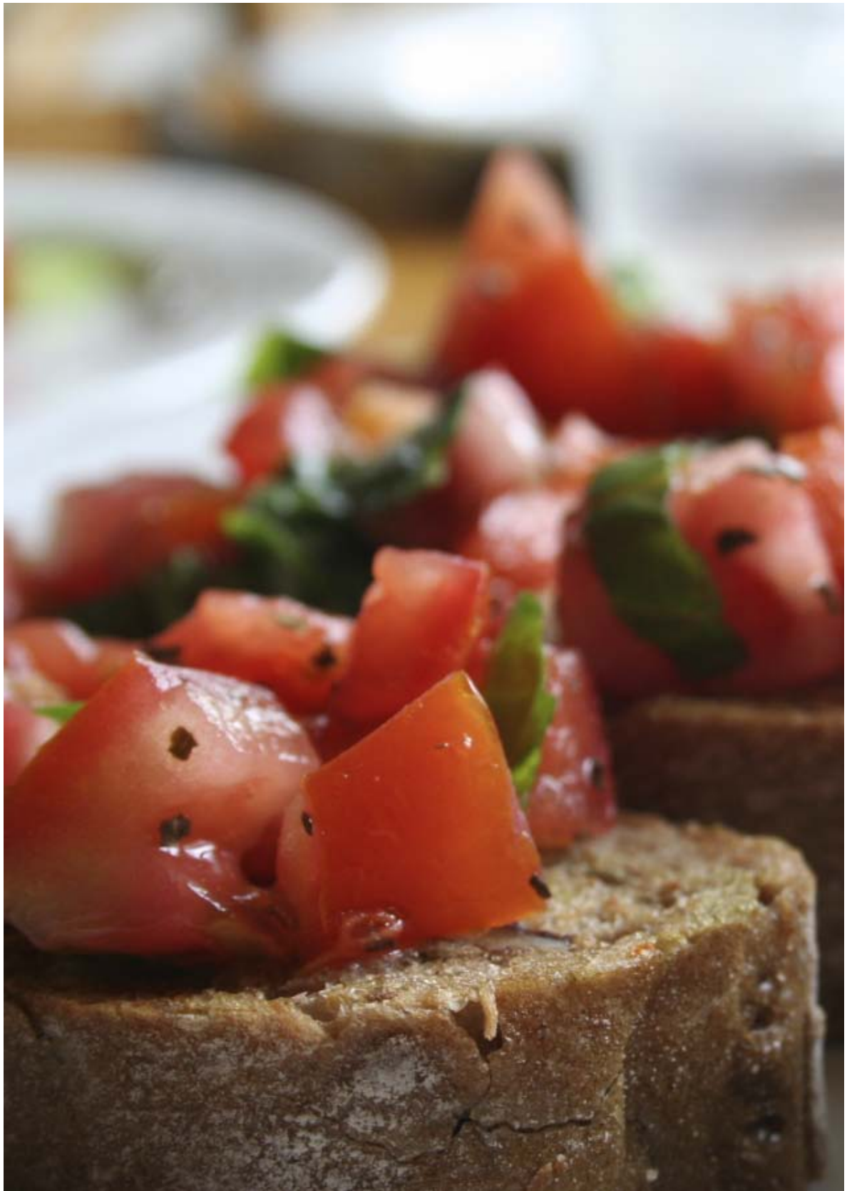
Tomato and Bocconcini Bruschetta