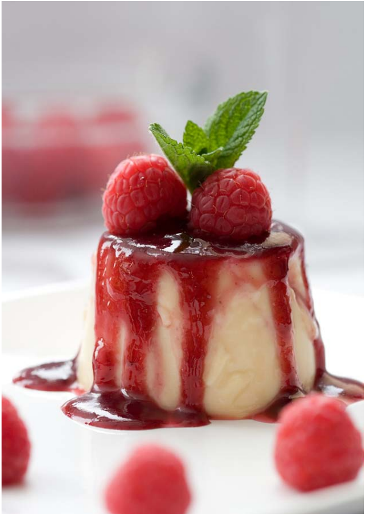
Panna Cotta with Strawberry Coulis