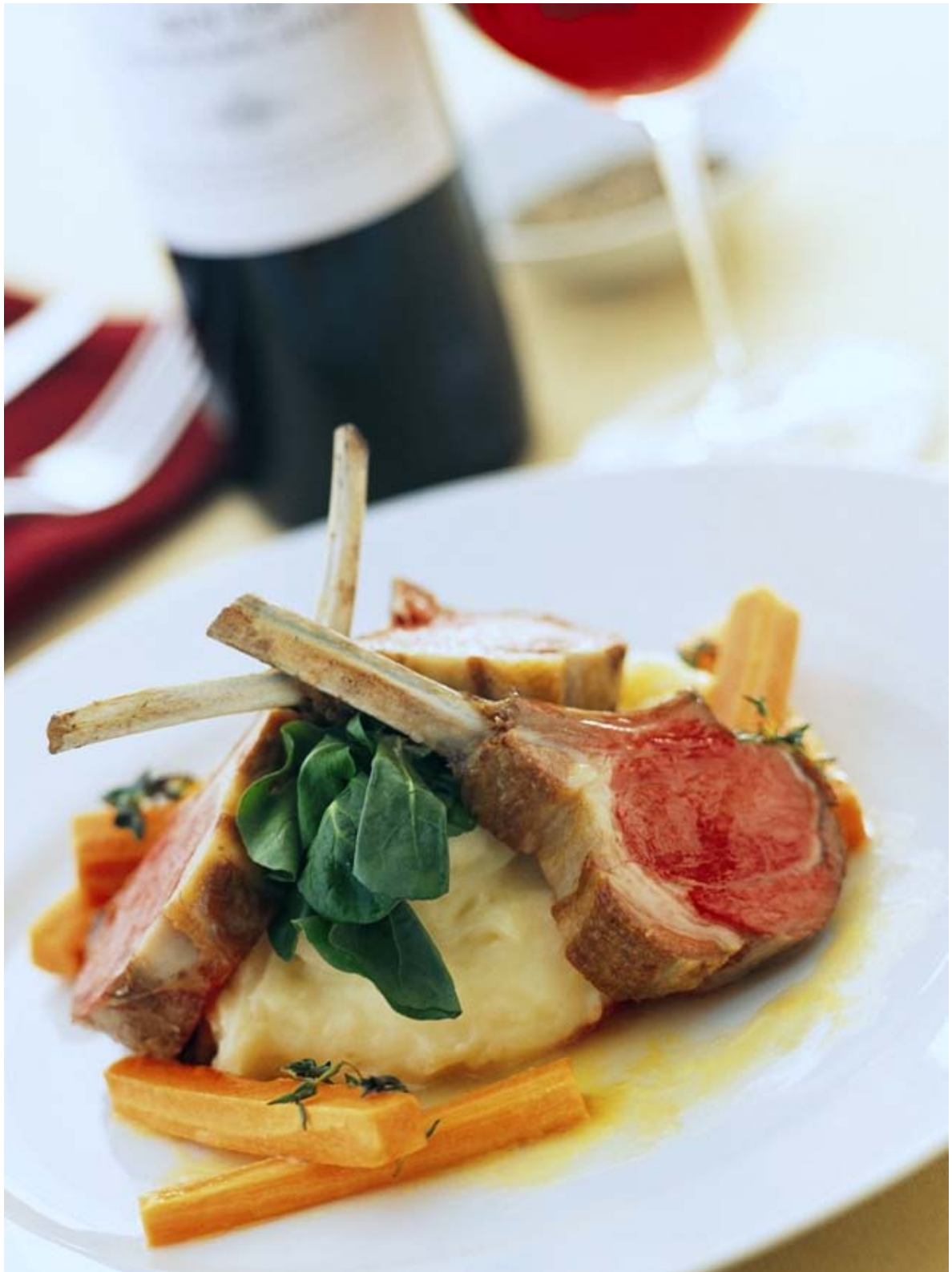
Rack of Lamb with Garlic Mashed Potato and Baked Carrots