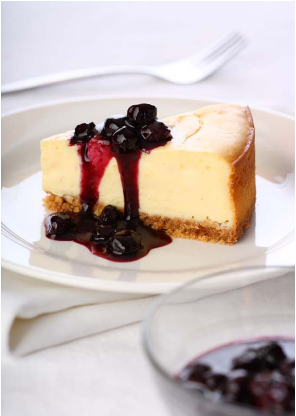
Baked Cheesecake with Flamed Blueberries