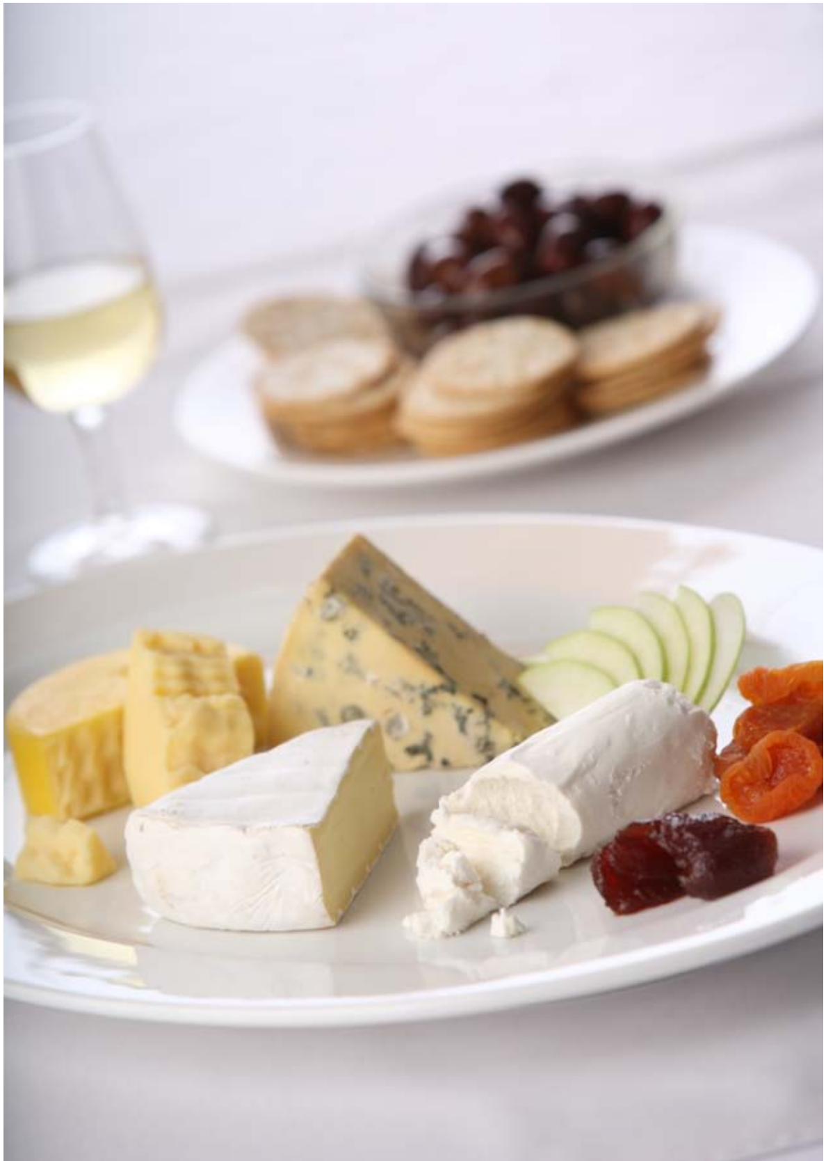
Sensational Cheese Platter