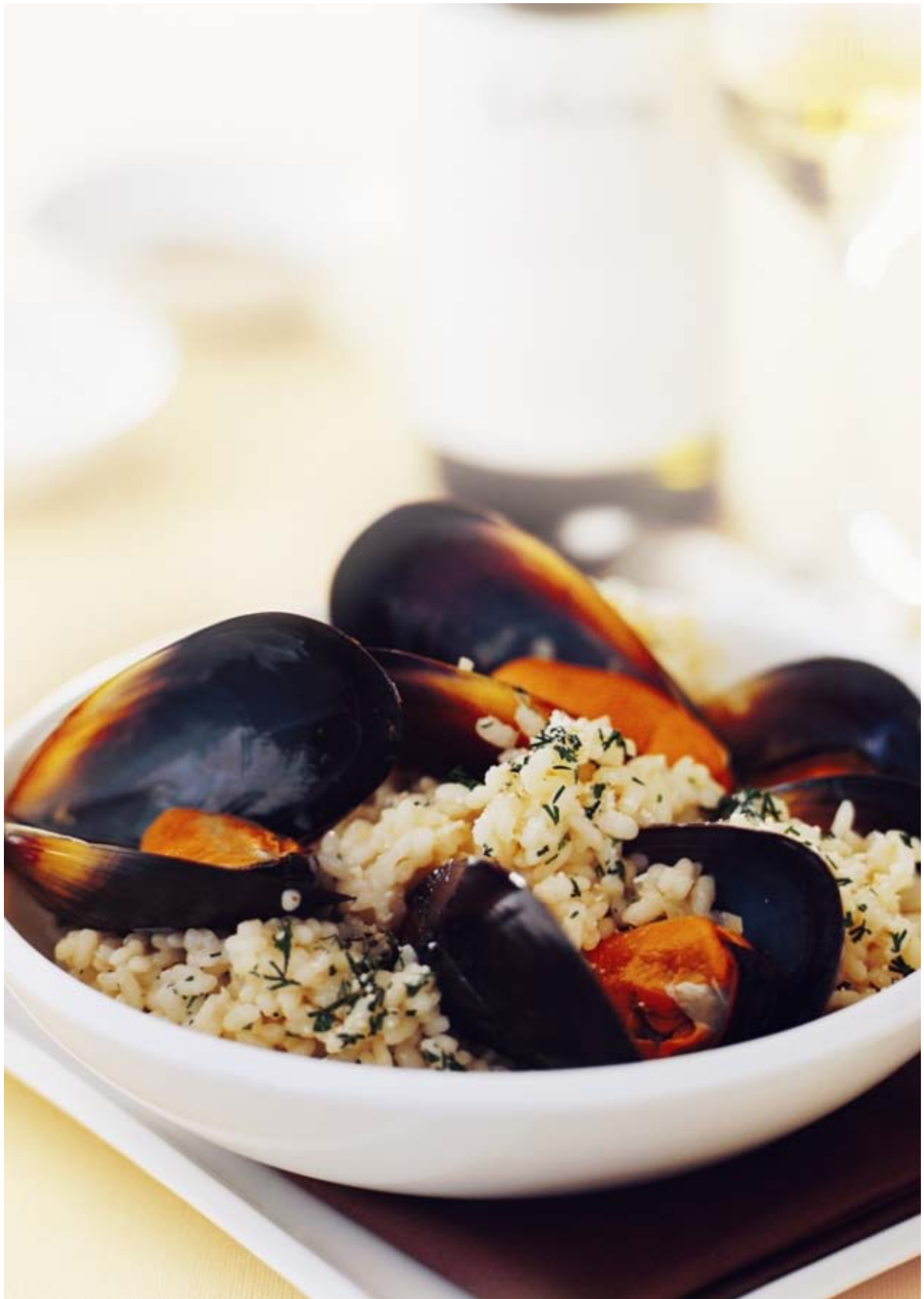
Black Mussel Risotto