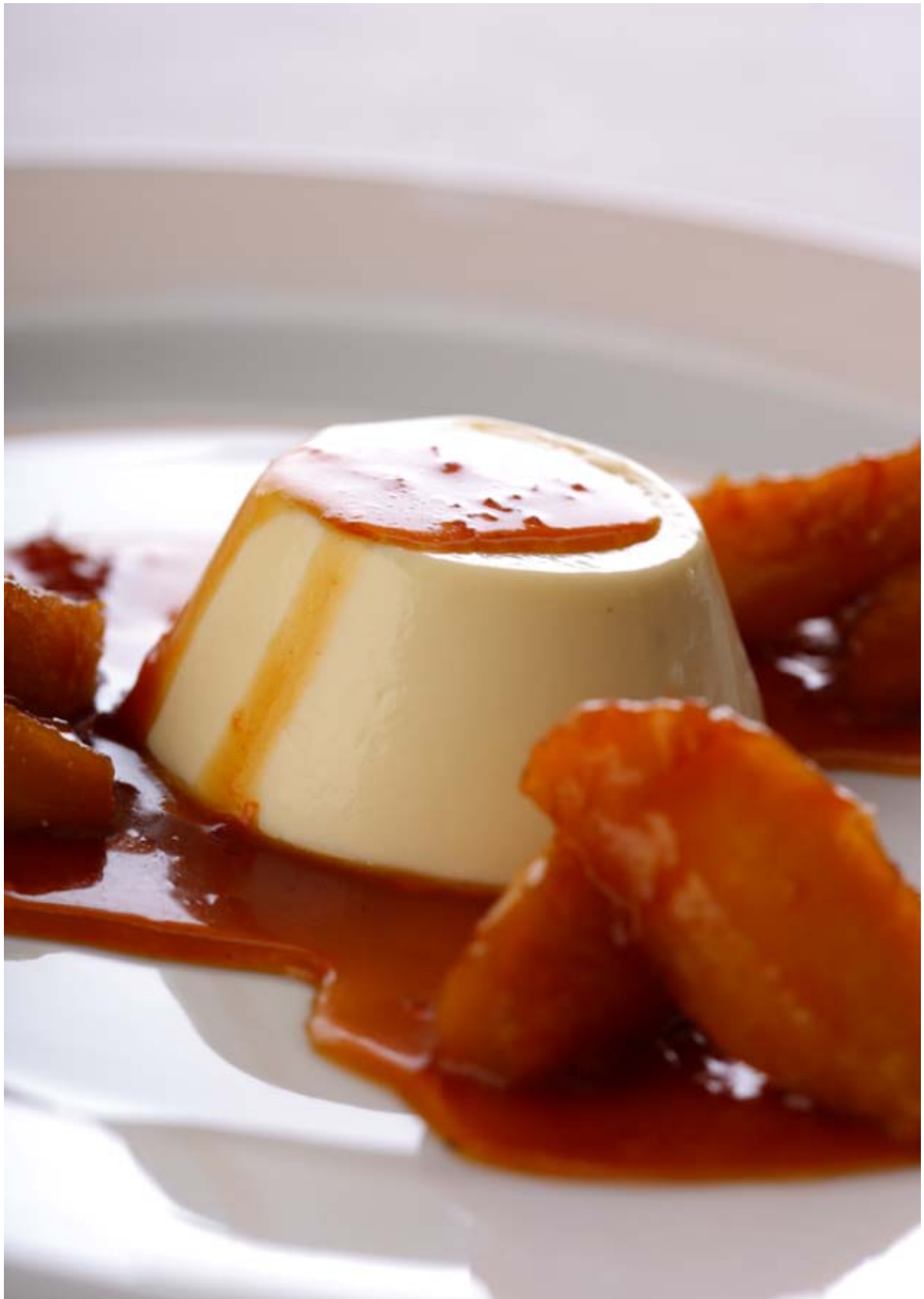
Panna Cotta with Caramelised Apple and Cinnamon