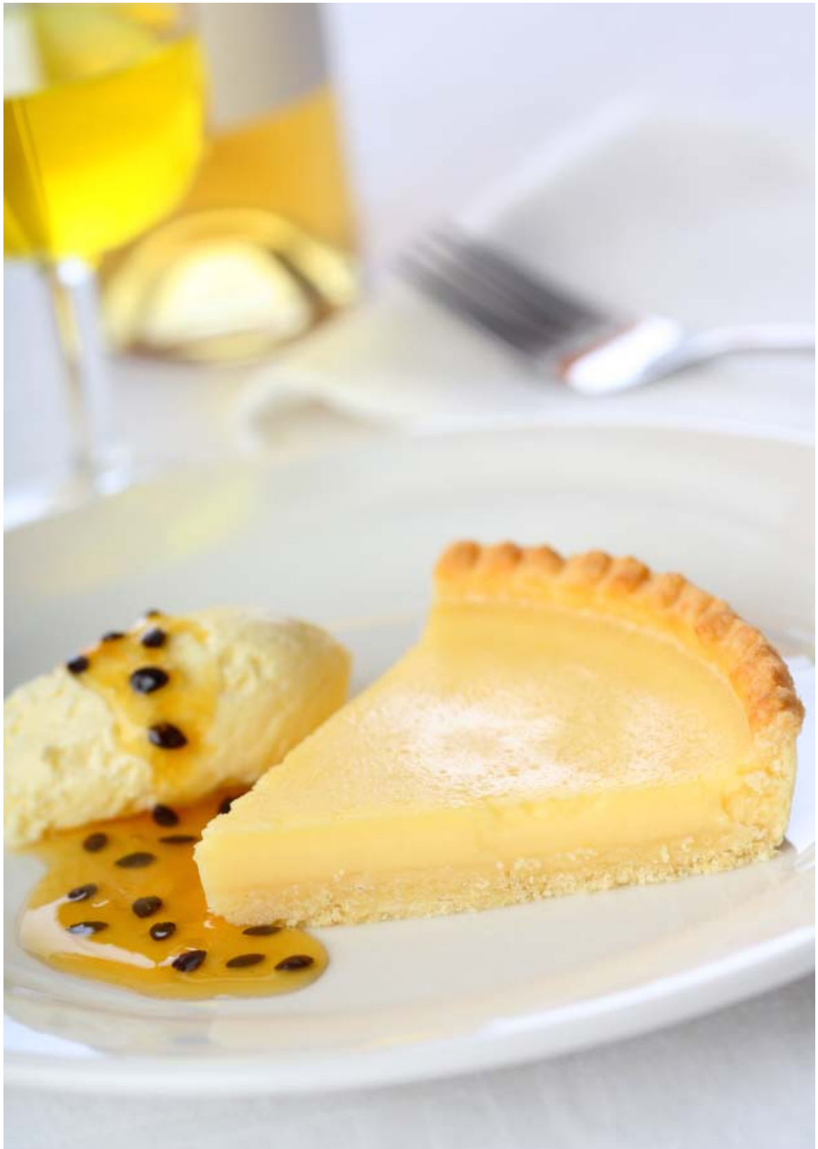
Lemon Tart with Passionfruit Sauce and Double Cream