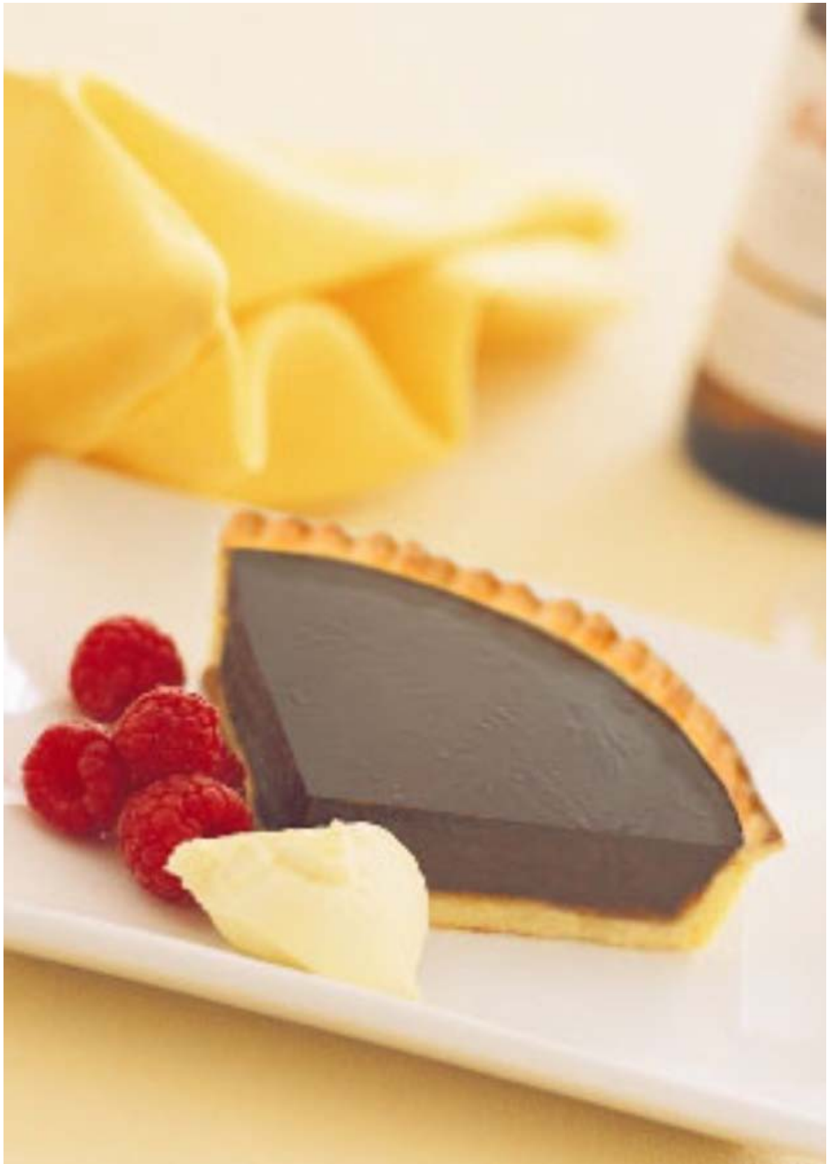
Chocolate Tart with Raspberries and Fresh Cream