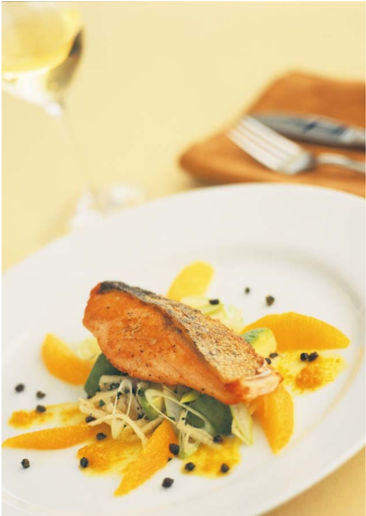
Atlantic Salmon on Avocado Salad with Warm Orange Vinaigrette