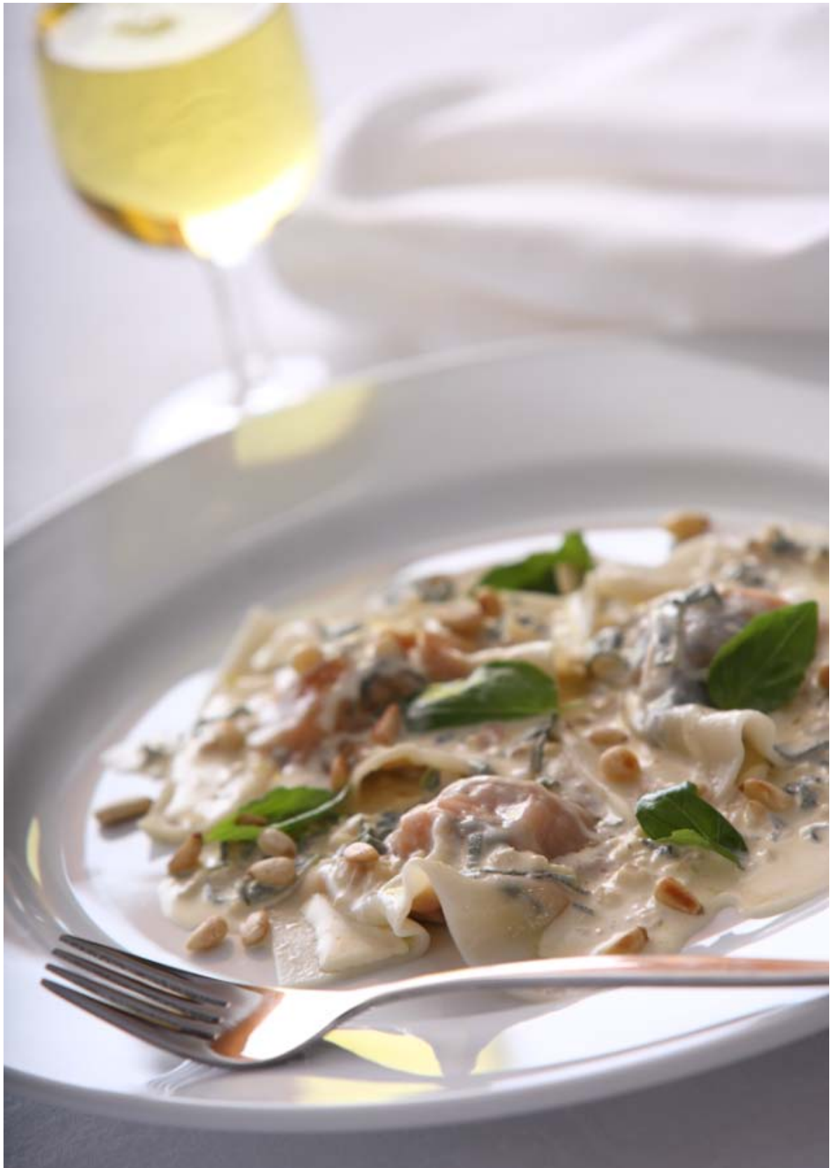
Pumpkin Ravioli with Parmesan in a Pinenut, Sage & Basil Cream Sauce