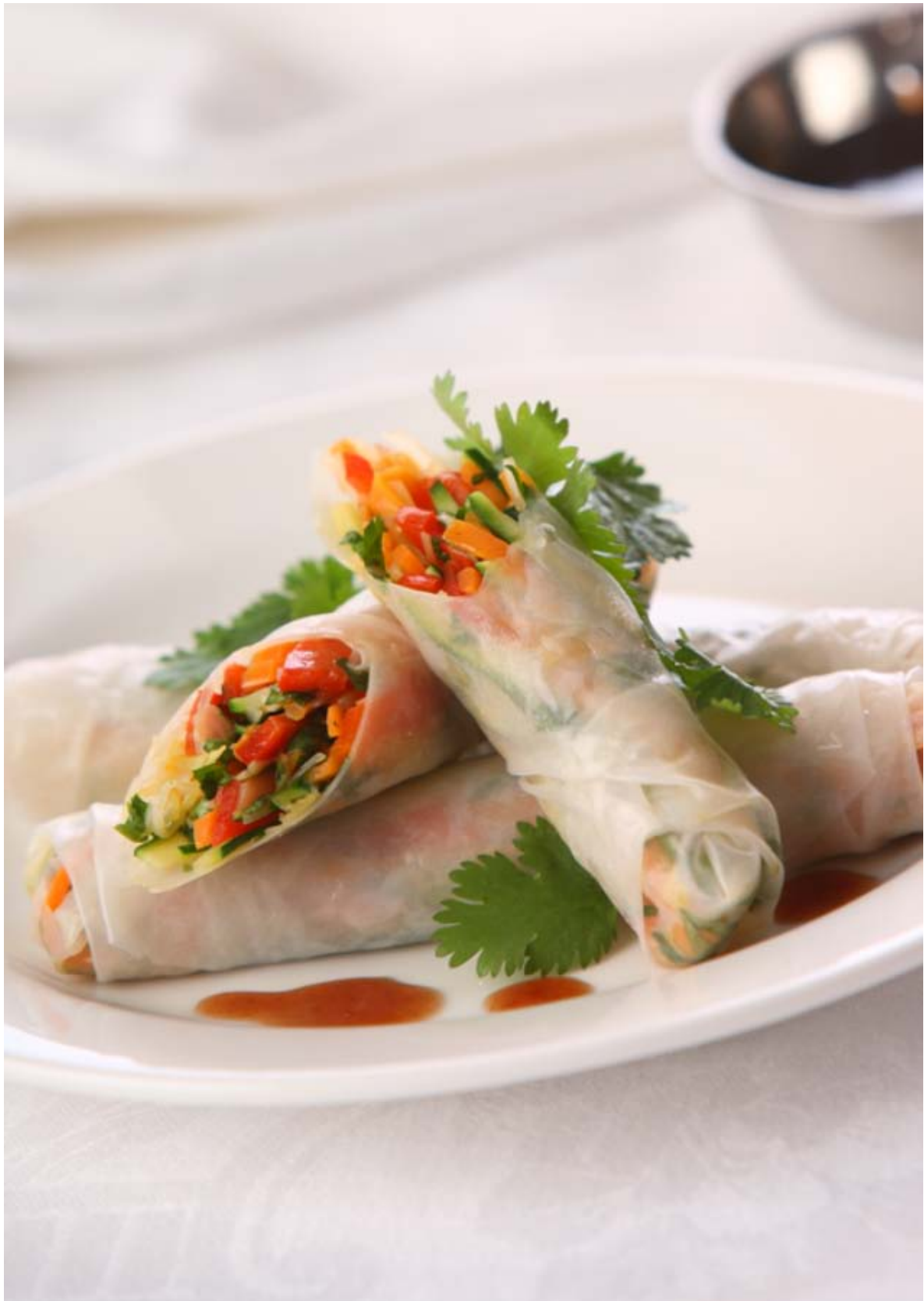
Vietnamese Rice Paper Rolls with a Plum Dipping Sauce