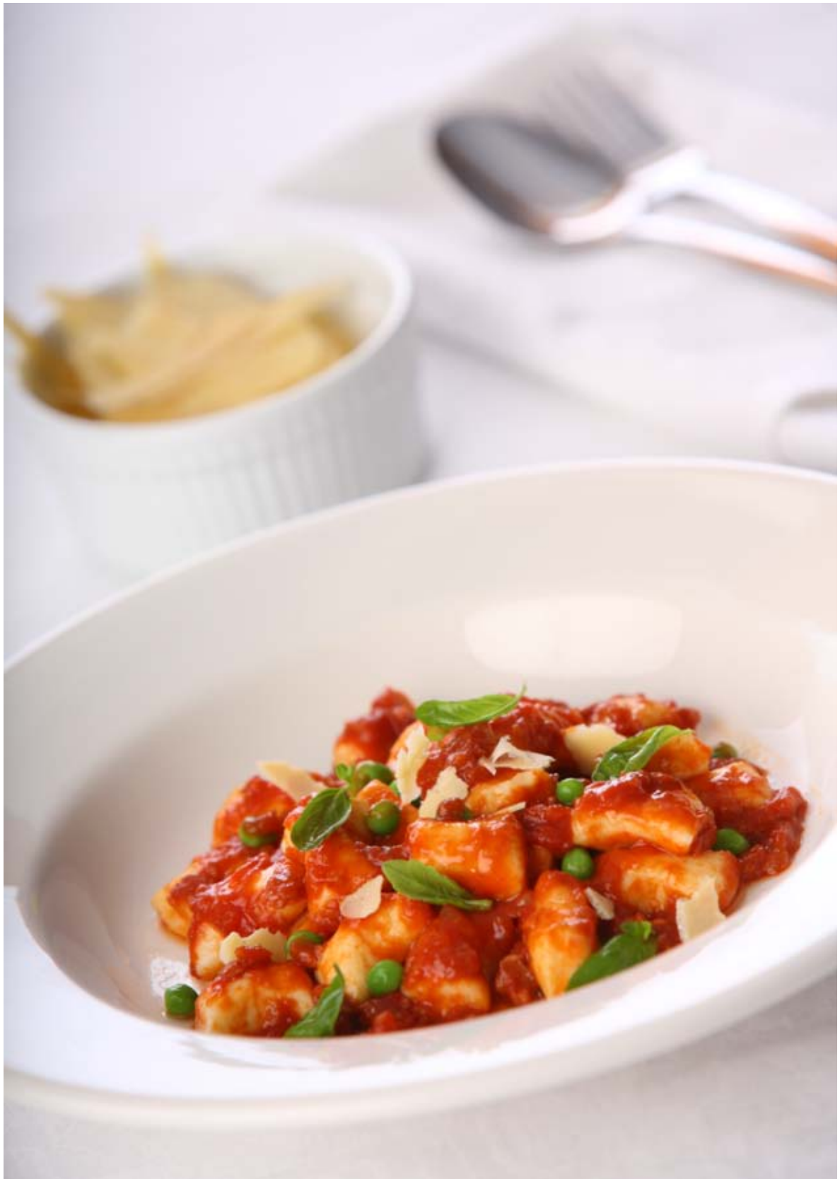
Potato Gnocchi with Tuscan Ragout and Pancetta