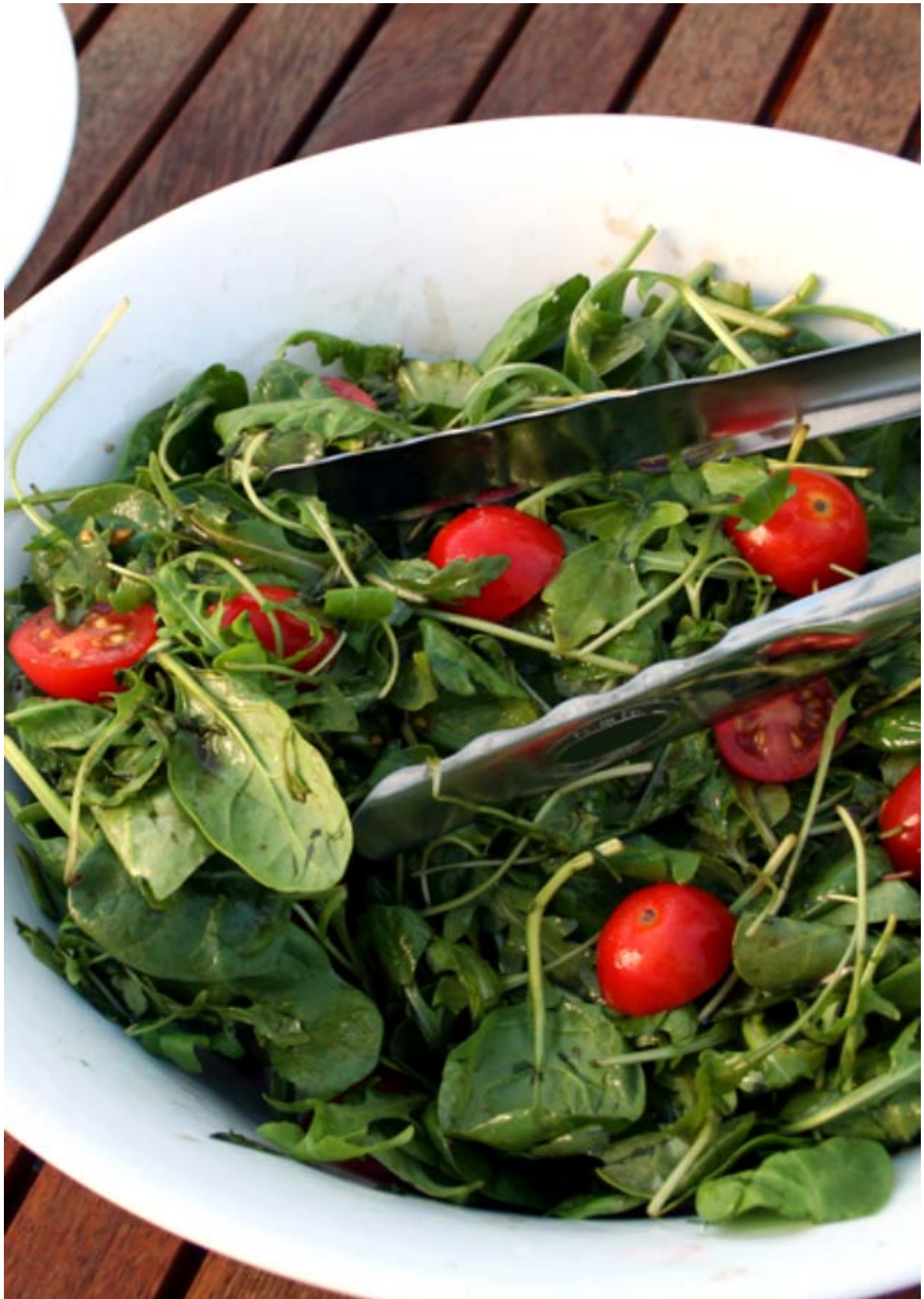
Three Leaf Green Salad with Cherry Tomatoes