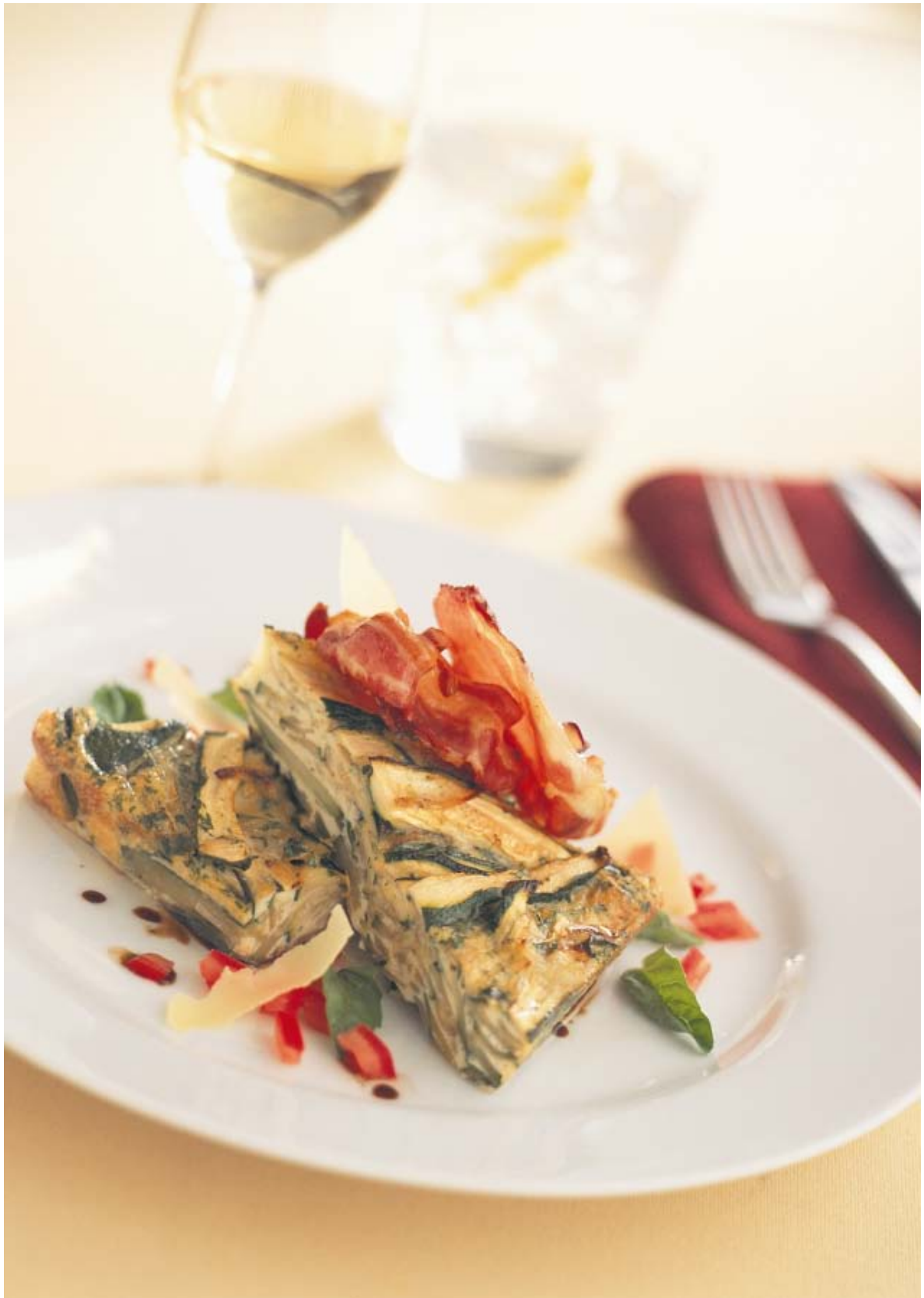
Zucchini Frittata with Crispy Pancetta and Tomato Salad