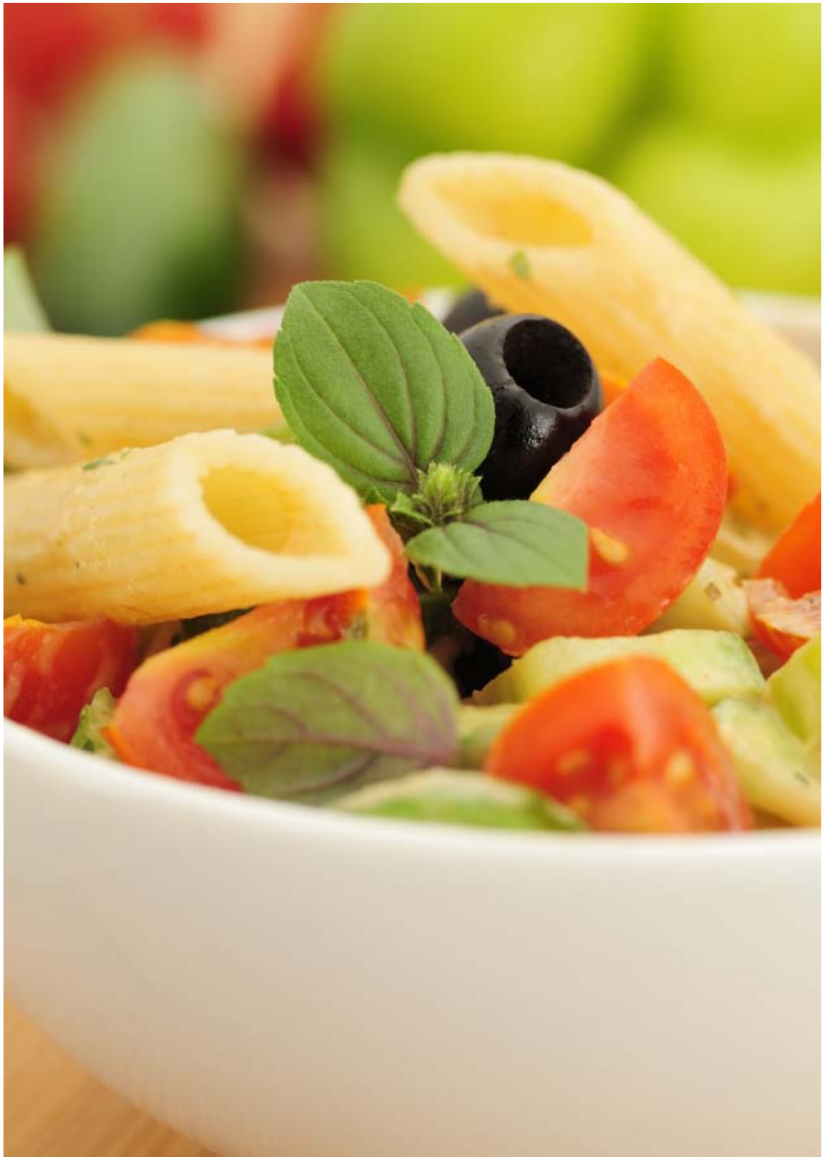
Pasta Avocado Salad