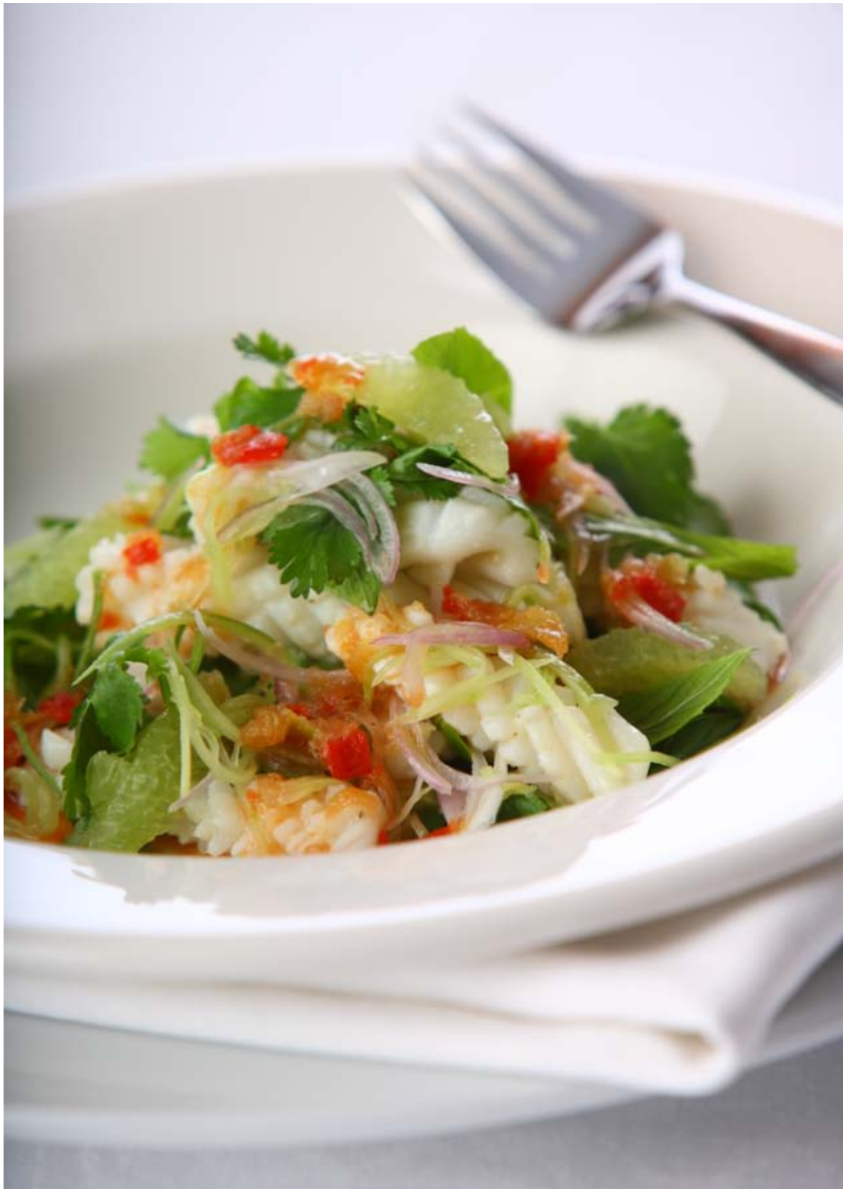
Thai Squid Salad with Mint, Coriander, Cucumber and a Red Chilli Dressing