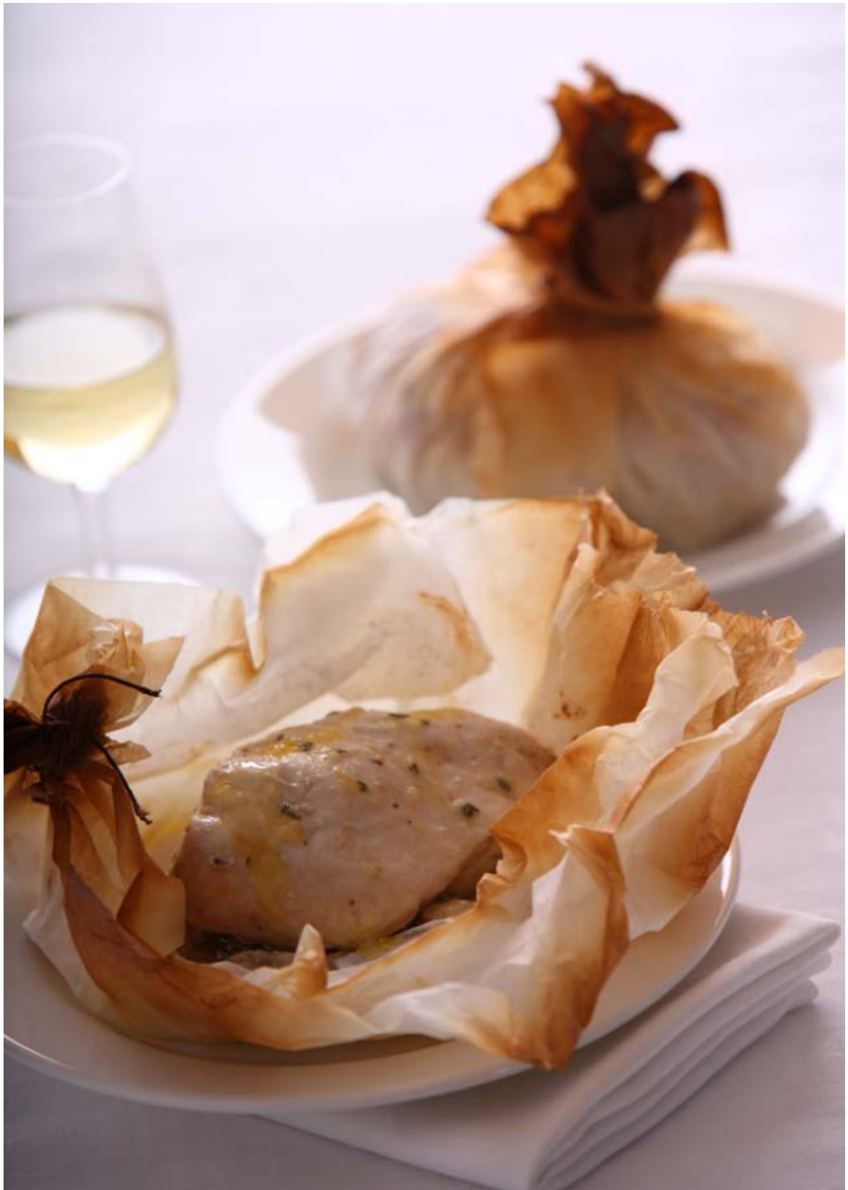
Poulet en Papiotte (Chicken Breast Baked in a Bag)