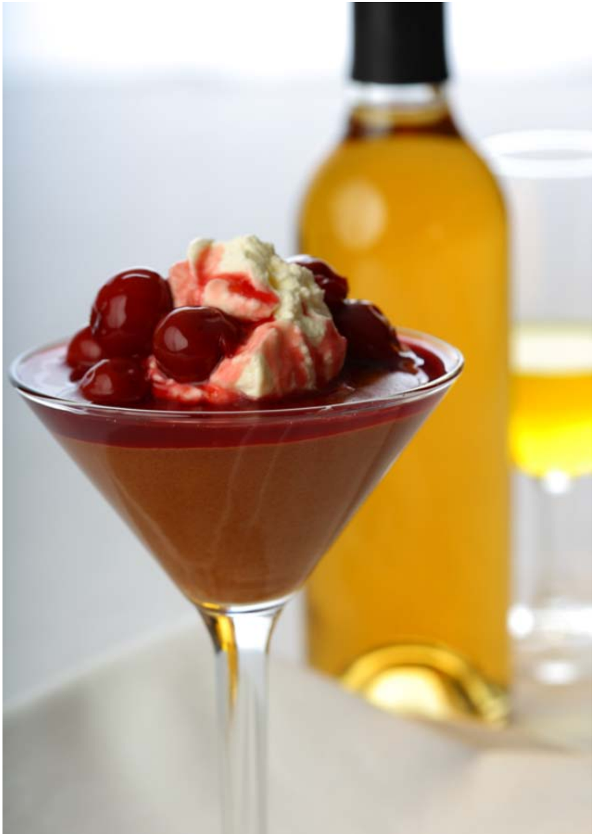
Dark Chocolate Mousse with Stewed Cherries and Fresh Cream